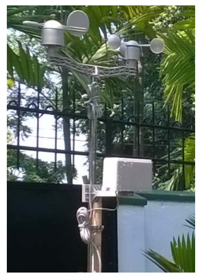
Figure 3: external sensors

Initial versions of the station had the following sensors kit. If the information received is doubtful, make sure that the cables are well connected, if need be, remove and re-insert the cables. There may be some leaves obstructing the rain collecting area of the rain gauge, they have to be removed for proper operation. The internal circuit board of the rain gauge is very sensitive to human contact and may not work properly if opened. Any malfunction should be reported to the local supplier, for warrantee, repair or replacement.