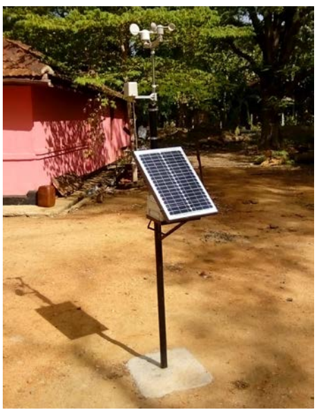
Figure 2: Local steel work example

If you have not set up the weather station on top of a roof, you most likely made a steel structure to support it. Maintenance of the steel structure goes to the builder, most probably the local blacksmith. He would have provided you, on delivery, with basic steel care information. If major steel work needs to be done, please contact the builder.