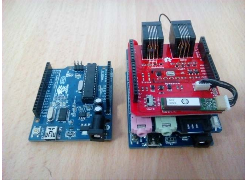
Figure 4: Arduino alone (Left), built with SMS and red weather shields (right)

The electronic should, at all time be available in double, one working set and a spare one in case of any issue. If an issue arises, first replace the electronics by the spare one, this will continue the recording with less damage. Then contact the local provider of this electronics to arrange a diagnostic or a direct free replacement (if under maintenance contract).